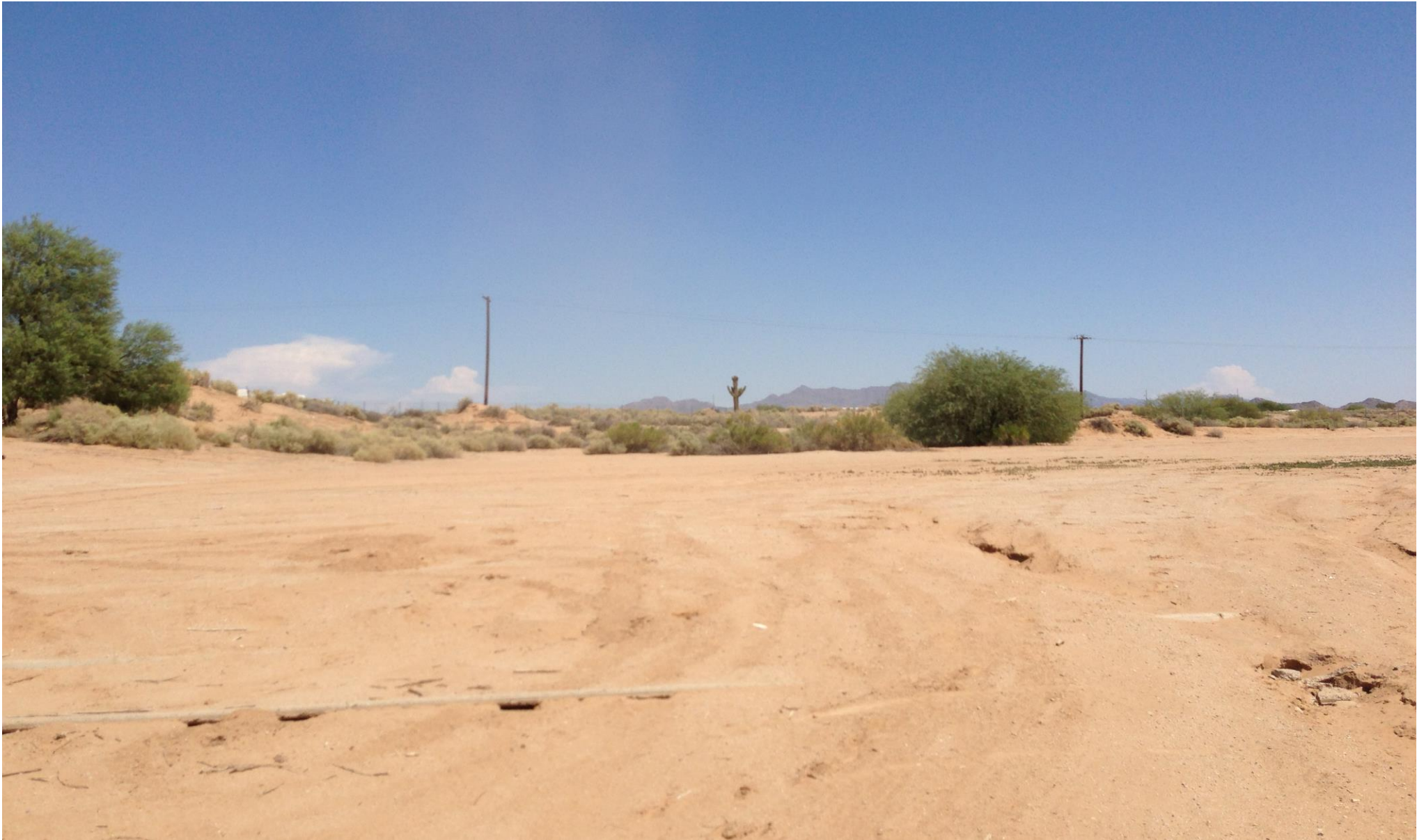
Partial View Looking Along East Boundary of the Property