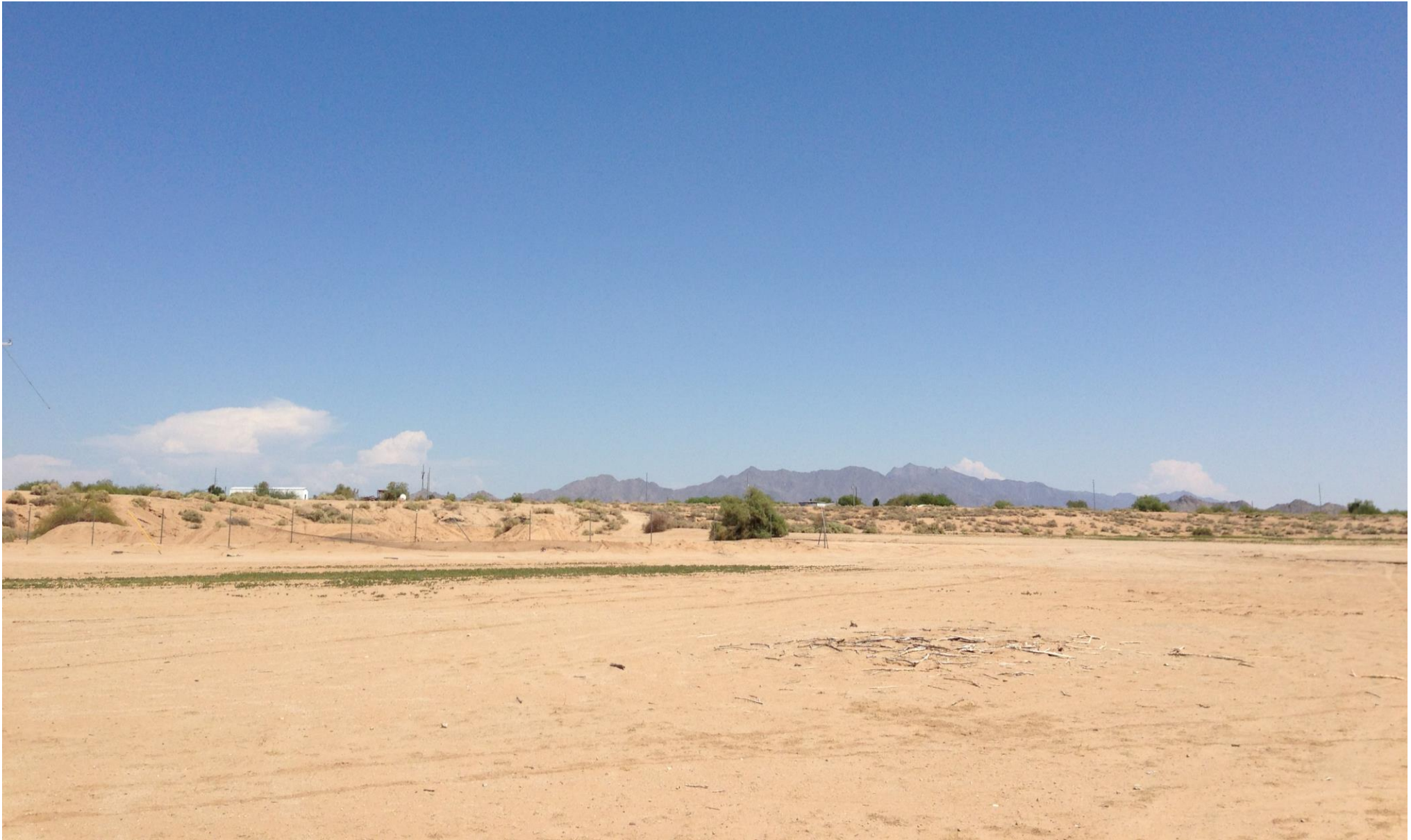
Looking East Across the Property