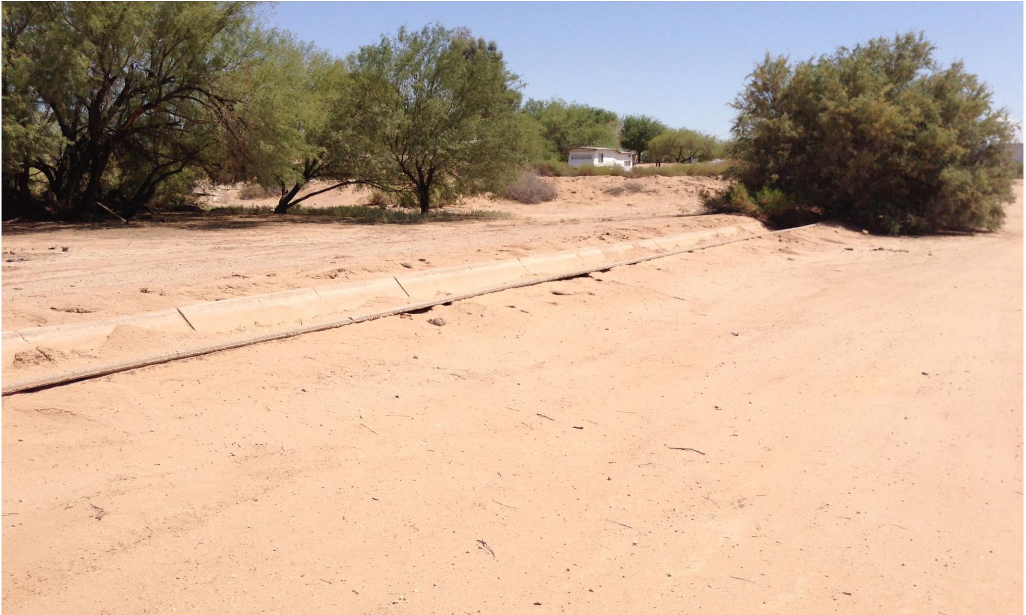
Partial View Looking along East Side of Property