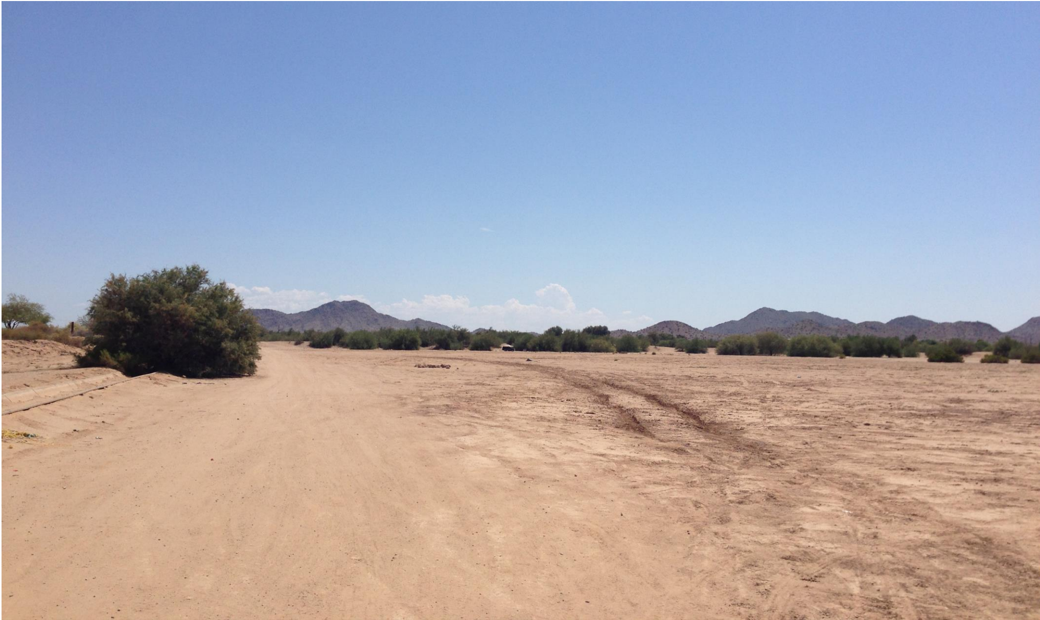
Looking South Across the Property

Raymond T. Cashen (602) 393-4447 phone www.cashenrealty.com