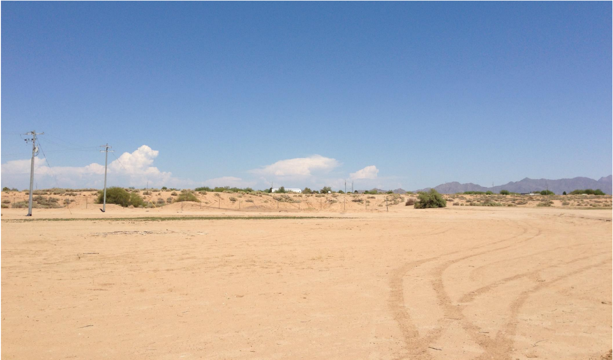
Looking East Across the Property