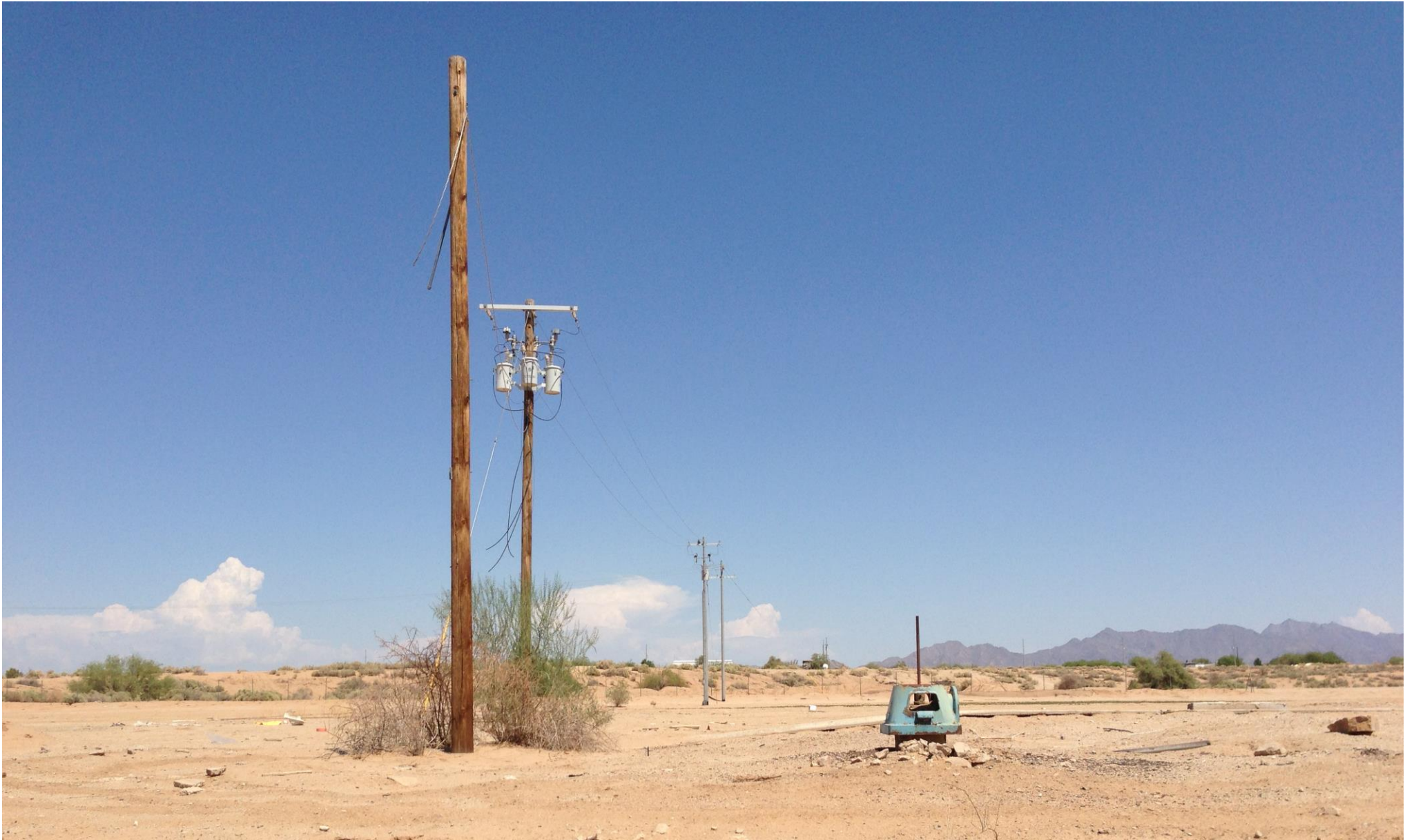
Former Well Site on the Property