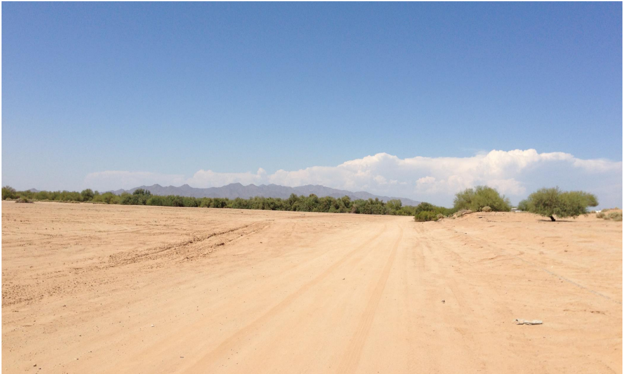
Looking North Across the Property