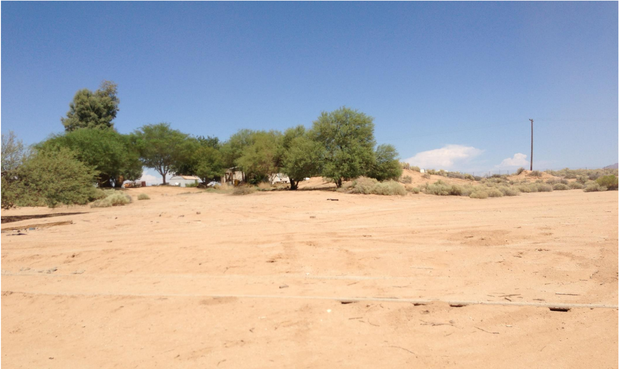
Partial View Looking North

Raymond T. Cashen (602) 393-4447 phone www.cashenrealty.com