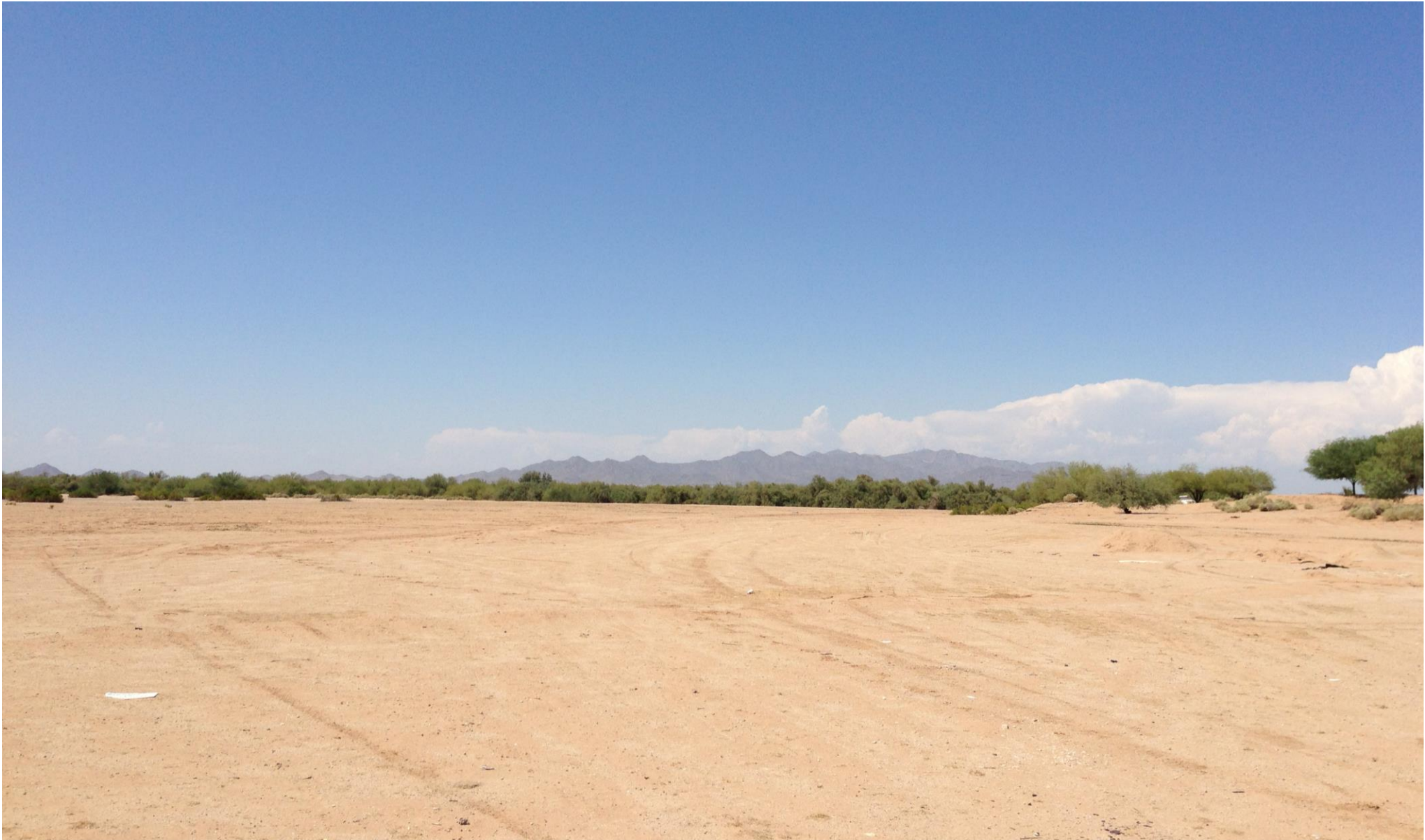
Looking North Across the Property