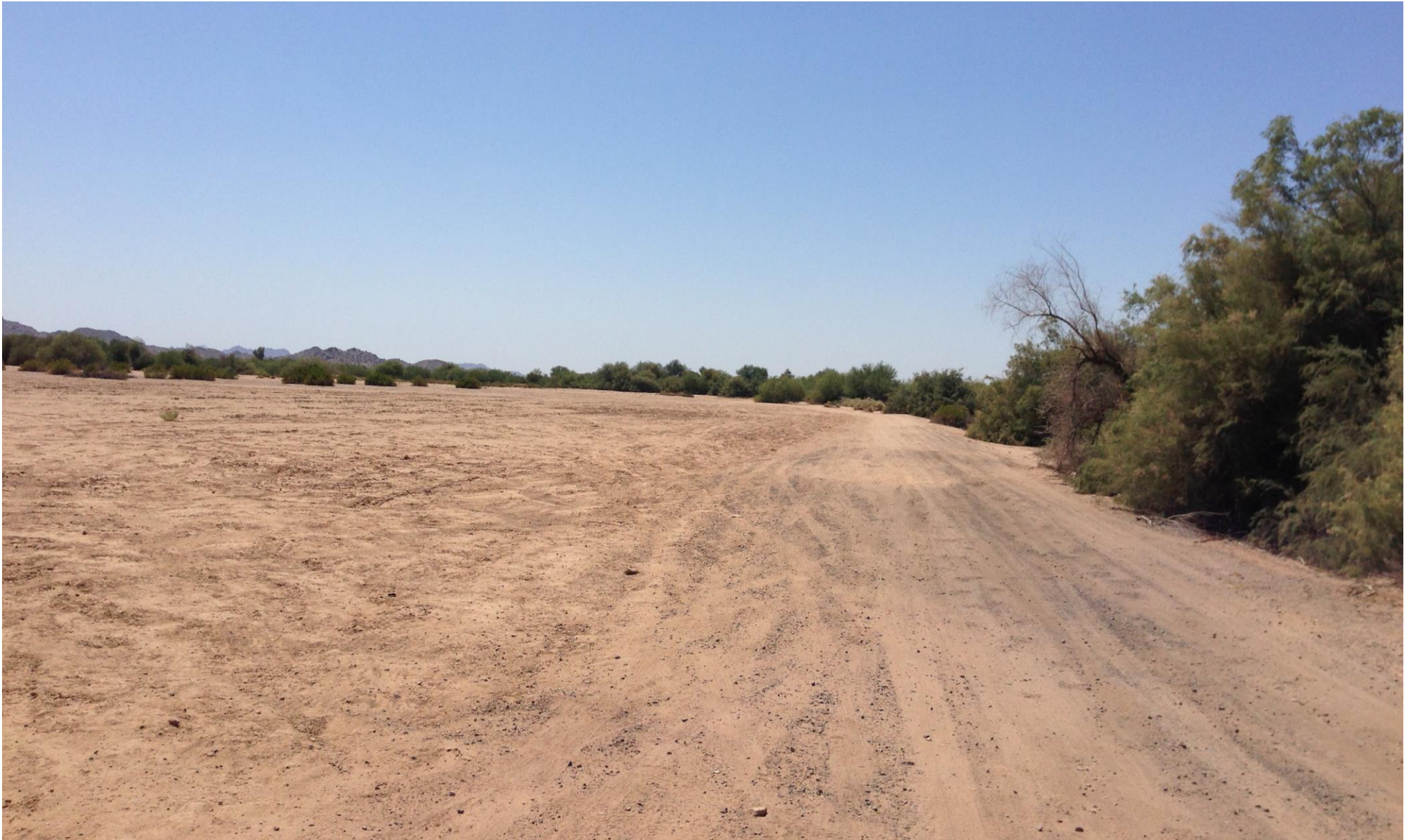
Looking West Across the Property