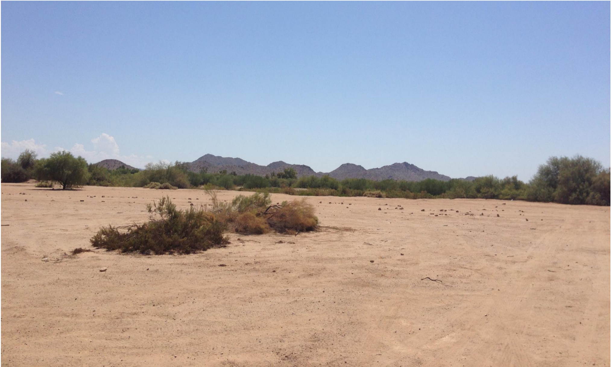
Partial View Looking at West Side of the Property